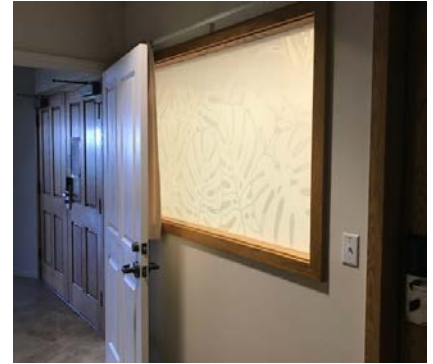
Sun Solutions tinted the picture window of BES guest bedroom. Owners and guests can now open the drapes to allow light in.