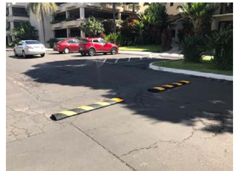
Engineering installed the speed bumps in five areas of the resort. Due to a defect, the speed bumps were removed. New ones will be ordered.