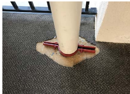
Protech Fire replaced the rusted dry standpipe clamps at Banyan building. Engineering is rust treating and painting the brackets red, for visibility.