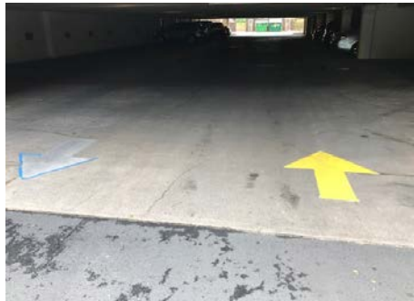
Engineering painted the directional arrows in the garage area.