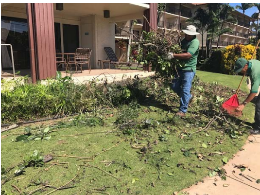
Landscaping cleaned the bushes away from the lanai of unit 3113 to prepare for railing installation by Paul Schurch Construction.