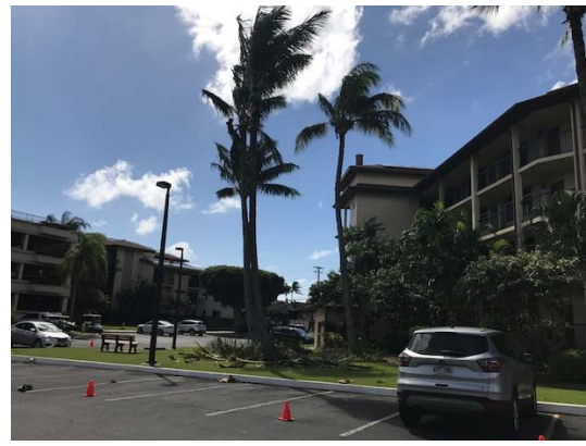
Coconut tree trimmers completed the semi annual trimming of the resort coconut trees.