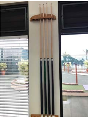
We have replaced all the pool cue sticks, ping pong paddles and balls.