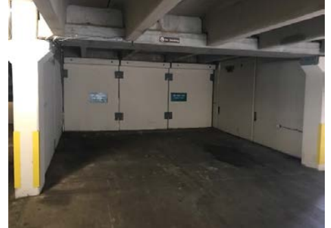
Engineering cleaned out the two stalls in the garage that had old mirror doors, refrigerators and other misc. items.