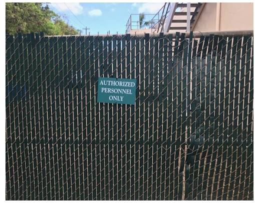
Engineering ordered and installed an "Authorized Personnel Only" sign at the entrance to the STP