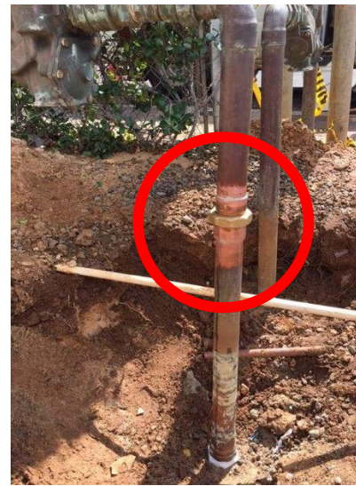
Cabreira Plumbig repaired the main water line to the Coral building. The fitting cracked inside the cement foundation.