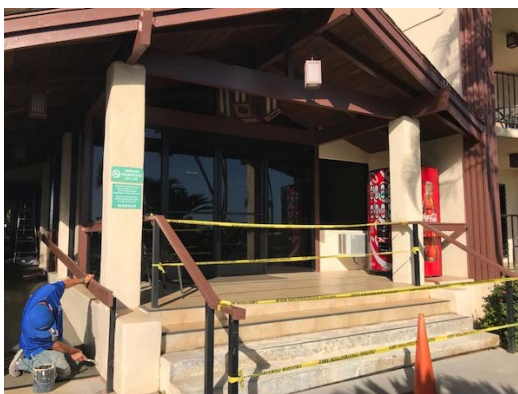
Engineering repainted the exterior of the Alii Conference room and hallway. Lihue Drapery prepped the steps for repair in January.