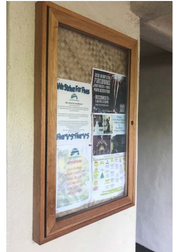
Engineering refinished the Bulletin boards around the property.