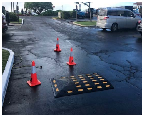
Engineering installed the speed humps on property.