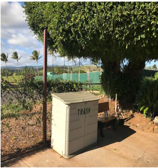
Engineering added a motion light to the Lika Lani smoking and Trash area.