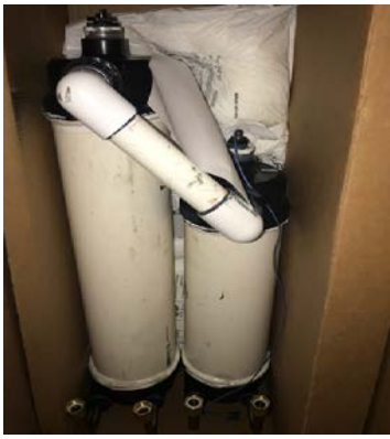
Oahu Air Conditioning replaced the Heat exchange for the Banyan Spa, which was under warranty.