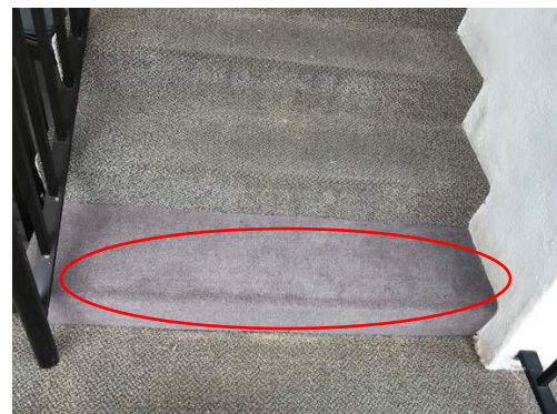
Lihue Drapery and Flooring replaced the torn carpet on the Banyan steps with the sample Marine outdoor carpet.