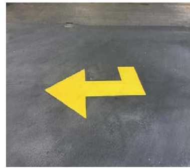
Engineering re-painted the directional arrows in the garage and curbs around property.