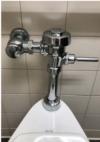
Engineering replaced the Banyan 2 nd floor men's toilet flushing system.