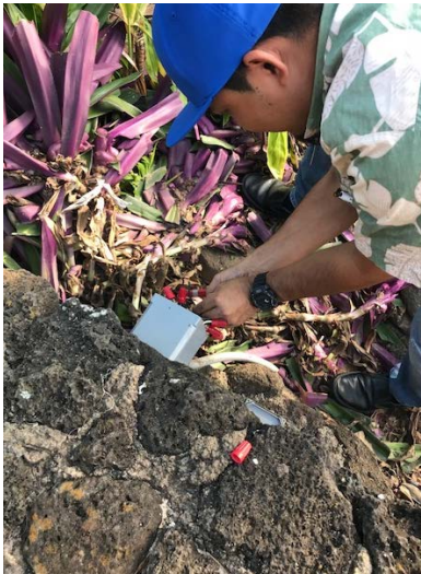
Engineering trouble shot the pathway lights at Coral. The main entrance lighting is causing it to trip. Engineering will be running a separate conduit for the main entrance lighting.