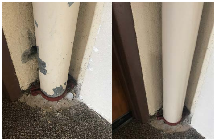
Engineering patched and painted the hole near the 1 st floor West Banyan dry standpipe.