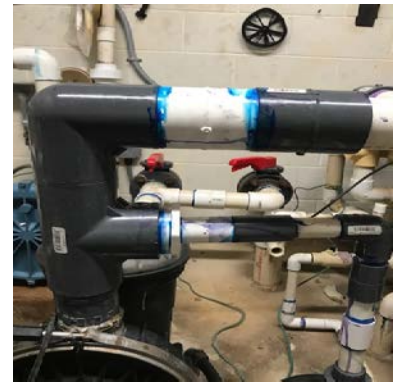
Engineering replaced the cracked housing of the Alii pool pump.