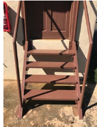
Engineering replaced the steps to the Banyan STP house. This was brought up as a safety concern in the safety meeting.